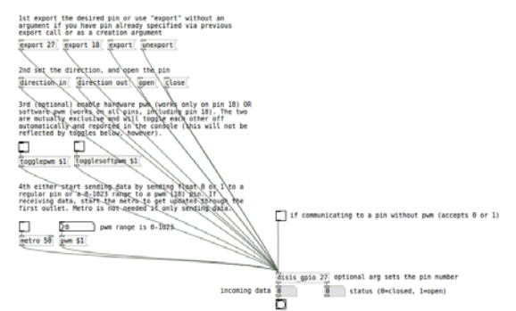
Figure 3. disis_gpio external help file.

disis_gpio will output connection status through the right inlet and data values through the left inlet (when using input mode). RPi has one hardware PWM-enabled pin (18). Its functionality can be accessed using "togglepwm" message (available only when in output mode) after which sending values between 0 and 1023 using the "pwm" message will determine PWM behavior (1023 being 100% on and 0 being off). The selected ranges are designed to correspond with Arduino's default behavior as per SARCduino's firmware [20] to allow for near-seamless transition between the two devices. This is particularly important as Pd-L2Ork also offers seamless integration with Arduino boards using the aforesaid firmware both in default and K-12 modes.