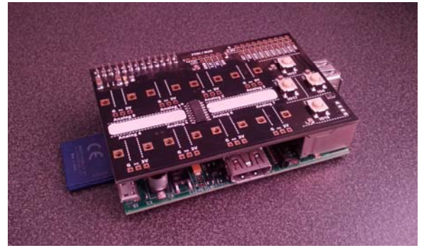
Figure 2. Raspberry Pi with a LOP shield (NOP variant).

Another notable feature of the NOP variant of the LOP shield is ability to immediately access GPIO 4 pins using 4 microswitches on the right. This can be handy in providing a simple access and configuration interface in headless situations, as well as an ability to test the connectivity without any additional sensors. In addition to colocated per-pin access to 3.3V, as is the case with other shields, LOP exposes one auxiliary 5V pin directly off the GPIO connector (the top-left pin on the Figure 2).