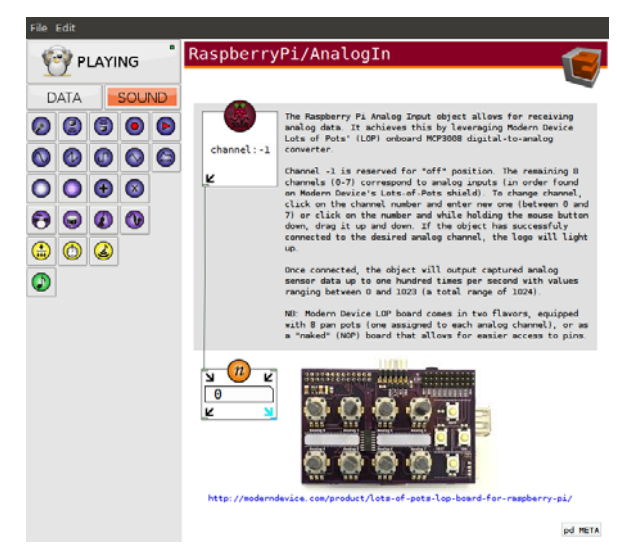
Figure 5. Pd-L2Ork K12 mode RPi analog input object.

Both externals come prepackaged with Raspberry Pi builds of Pd-L2Ork, together with supporting documentation. Users can access externals in the default mode, as well as through a collection of K12 abstractions and their supporting documentation designed to provide turnkey access to said functionality (Figure 5). Prebuilt deb packages for the PdPi distribution, and a detailed documentation on how to set up the system can be found on L2Ork's website at http://l2ork.music.vt.edu/main/?page_id=2288. The source can be retrieved from Pd-L2Ork's git page [26].